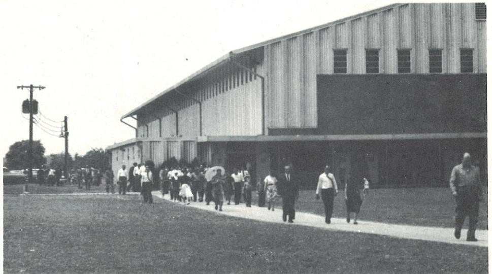
SERVICES OVER—Brethren walking toward dining hall for the noon meal. The physical food this year was surpassed only by the spiritual.

As another Passover ended one could help contemplating that in a very short time from now, we shall, through God's mercy, be taking the Passover with Jesus Christ—PERSONALLY IN HIS KINGDOM!